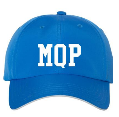
ITEM #12- $22