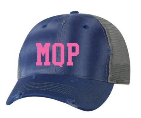
ITEM #13 - $18