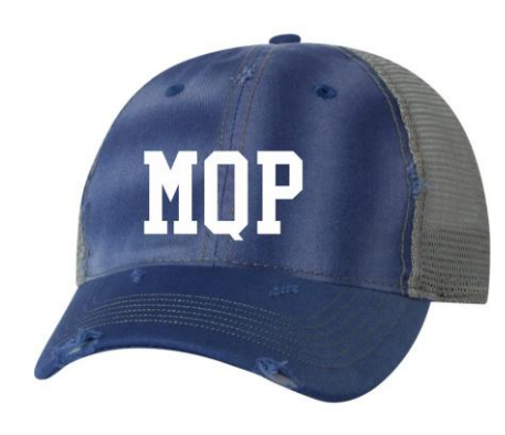
ITEM #14 - $18