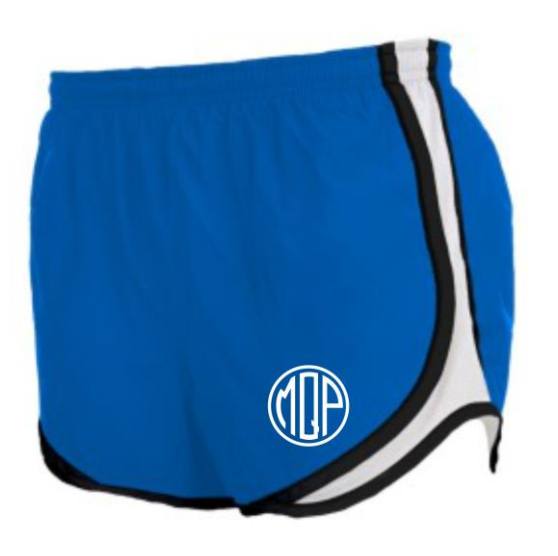
ITEM #9 - $18

The following items CAN NOT be worn alone as part of Friday Spirit Wear. They may be worn to and from school but NOT during the school day.